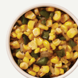
CORN + POBLANO (V)