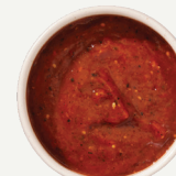
SMOKY GUAJILLO (V)