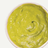
AVOCADO CREMA (V)