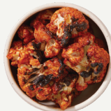
CAULIFLOWER AL PASTOR (V)