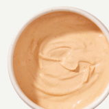
CHIPOTLE CASHEW CREMA (V)