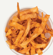
TORTILLA STRIPS (V)