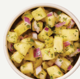
PINEAPPLE PICO DE GALLO (V)