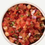
PICO DE GALLO (V)