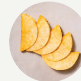
CRISPY CORN TORTILLA (V)