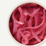
PICKLED ONION (V)