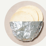
FLOUR TORTILLA** (V)