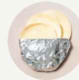
CORN TORTILLA (V)